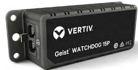
Vertiv™ Geist™ Watchdog 15

Vertiv™ Geist™ Watchdog is a compact environmental rack monitoring solution with on-board temperature, humidity and dew point sensors and the capacity to support four external sensors. With Vertiv™ Watchdog you can view real time sensor data from a secure web interface and receive alerts via email, SNMP, or email-to-SMS. The solution is simple to install and configure and requires no special software.