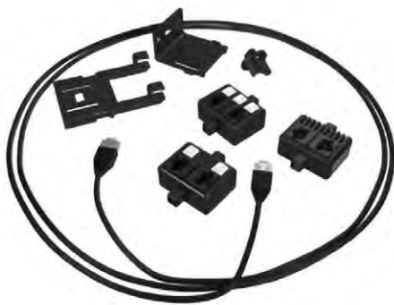
Vertiv™ Liebert® SN Sensors

Both product lines are available in integrated or modular configurations. The integrated sensors can be attached via a single cable and usually integrate two or more of these sensing points: temperature and humidity; temperature, humidity, dewpoint; multi-point temperature; and several other configurations.