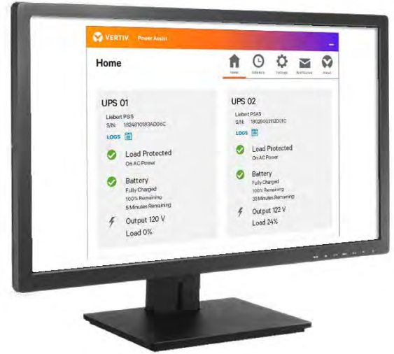
Vertiv™ Power Assist

Vertiv™ UPS communication cards can also support connectivity to building management and remote monitoring software such as Vertiv™ Environet™ Alert.