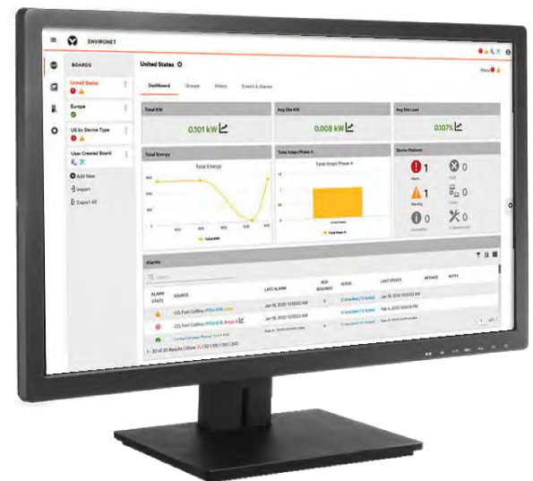
Vertiv™ Environet™ Alert