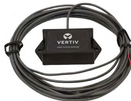
Vertiv™ Geist™ Sensor