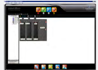
Real-time monitoring of power and cooling status.