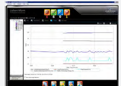
Trending – Map performance over time

Liebert® Nform Centralized Monitoring Software allows centralized, real-time monitoring for any SNMP device that supports a network interface.